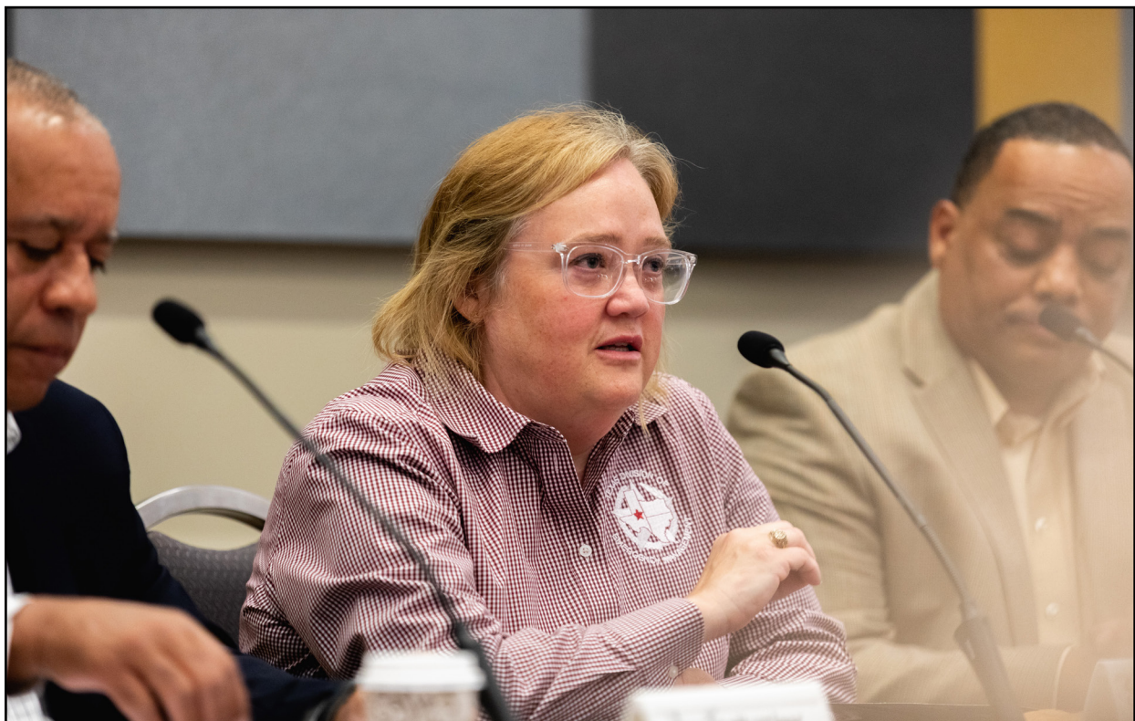
(May 2022).

The panelists shared their greatest concerns – the things that keep them up at night.