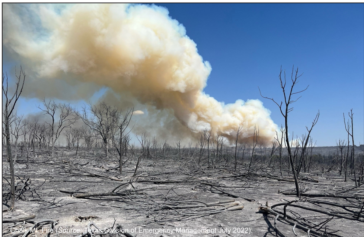
Chalk Mt. Fire