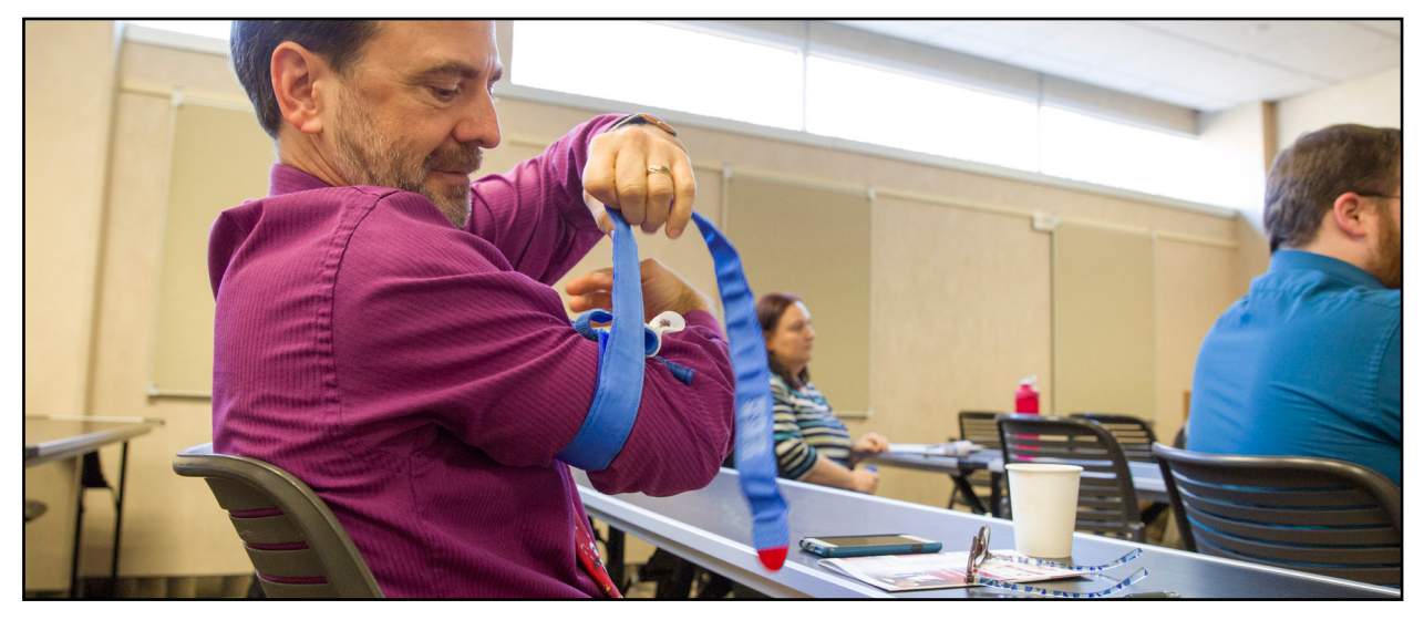
University of Georgia's Emergency Preparedness Office regularly teaches Stop the Bleed to faculty, staff, and students.

Although the term immediate responders might be new to some, there has been an increase in this type of response. Examples include events/venue staff, coaches, athletic trainers, security officers, and Community Emergency Response Team (CERT) members. Cardiopulmonary resuscitation and automated external defibrillator (CPR/ AED), basic first aid, search and rescue, locating lost children, etc. are typical training topics for immediate responders. Added to this list of training opportunities should be administering lifesaving STOP THE BLEED® (STB) measures (direct pressure, wound packing, tourniquet application). In addition to the immediate responders mentioned above, other groups that would benefit from STB training include: