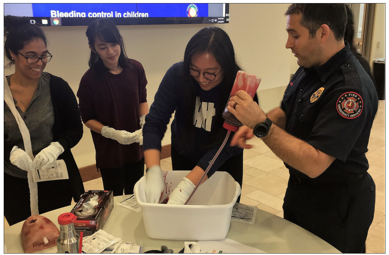
Cobb County (Georgia) shows Kennesaw Student nurses how to pack a wound as part of the national Stop the Bleed program.

This non-exhaustive list provides suggestions to encourage others to think about possible immediate responders within specific organizations. By getting STB training, the people within an organization would be more prepared to respond to an incident immediately.