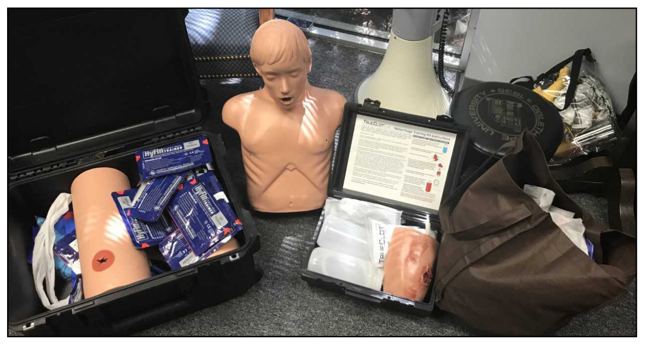
Some STB classes go beyond the three basic concepts of direct pressure, wound packing, and tourniquets, and include how to use Chest Seals ( Source: Altizer, February 2019).